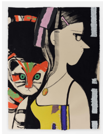
Ellen Berkenblit, Ripperton , 2024, Gouache, graphite and Kozo paper collage on Legion Stonehenge paper, 30 3/8 x 22 inches (77.2 x 55.9 cm)

Berkenblit recently began integrating pieces of Kozo paper into her gouache compositions. The behavior of this paper - made from the fiber of mulberry trees and full of texture - opened up exciting ways to layer color and surface. By cutting out shapes, or ripping it into strips to retain a feathered edge, she could both manipulate the material with precision and also work with uncontrollable surprise and chance. In these latest works, color and material become confluent, as if the artist paints with paper. A large-scale oil painting on linen "Apricot McCoo" accompanies the group, together showcasing the artist's masterful handling of color, her confident line, and deep understanding of the alchemical interactions between paint and surface.