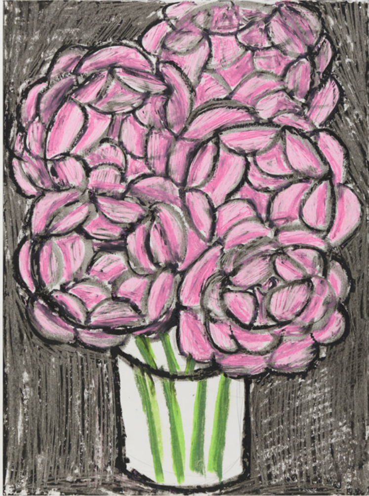
Hein Koh Peonies , 2024 Oil pastel on paper 12 x 9 inches (30.5 x 22.9cm)