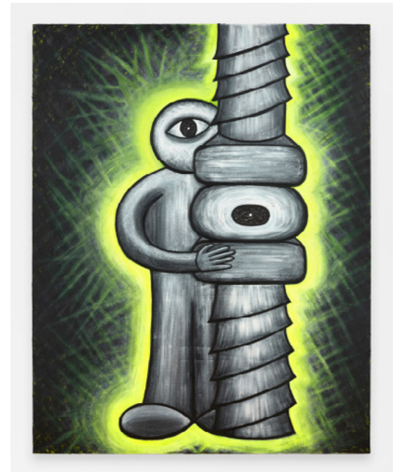
Mammo , 2024, Acrylic, oil, and oil stick on canvas, 96 x 72 inches, (243.8 x 182.9 cm)

The 15 paintings featured in Hope Springs Eternal are predominantly black and white (with inflections of neon-yellow, orange, or blue), and half feature the eye-person prominently. This round-headed figure is an old friend, featured in works from 2015 and now re-emerging in Koh's practice. Its inception came from a similar experience of spiritual searching. After giving birth to twins that year, Koh started to process her experience through drawing. The routine of drawing eased fears related to the chaotic, identity-shattering experience of motherhood, and the mysticism and stress of having two newborn twins. Cyclops manifested itself then, in those post-hospital scrawls. In a similar way, the experience of being diagnosed with breast cancer necessitated processing and a need for "paring down." This made room for cyclops to re-appear, recast as the artist's primary symbol during this healing period.