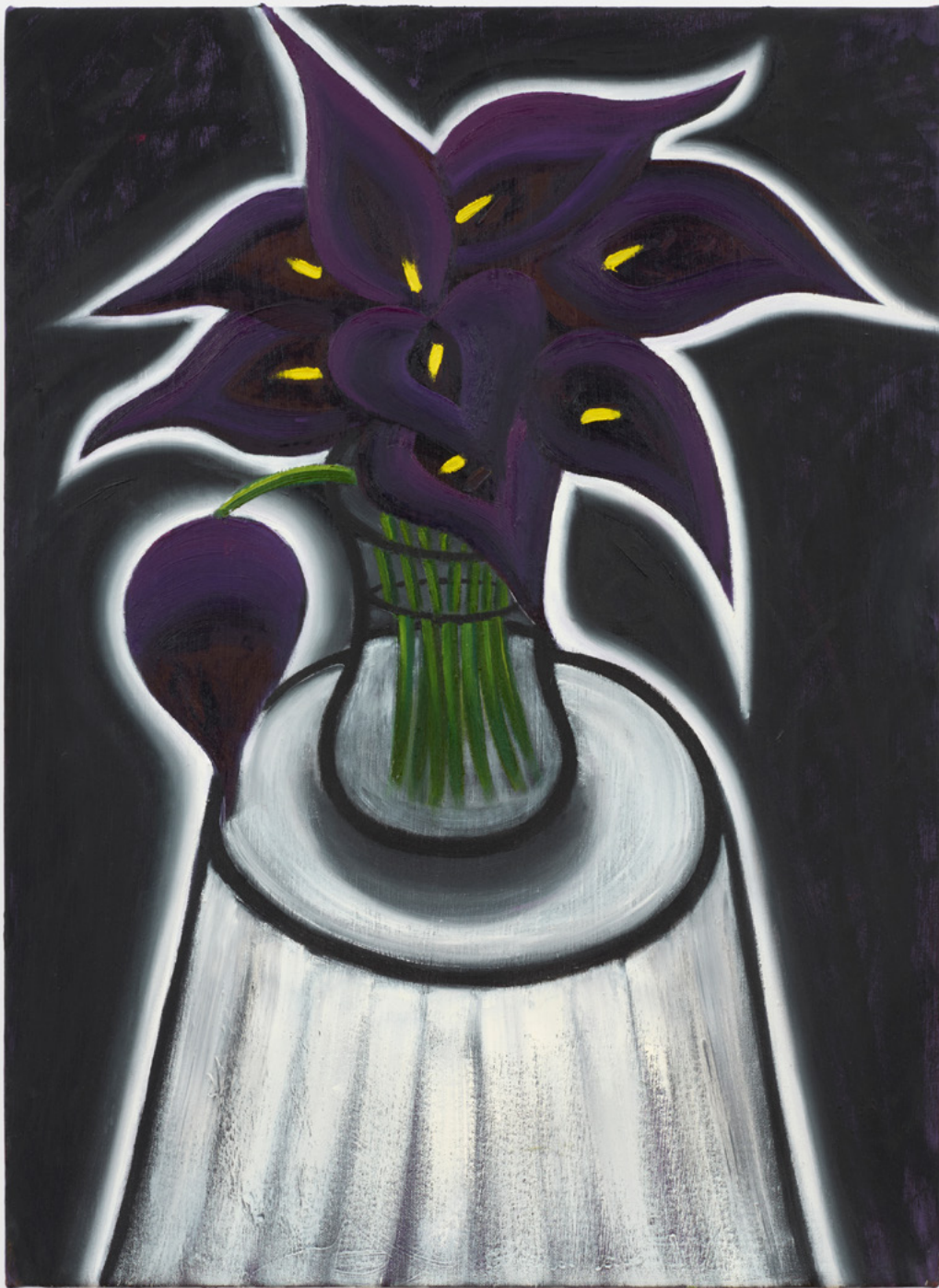
Hein Koh Calla Lilies , 2024 Oil on canvas 30 x 22 inches (76.2 x 55.9 cm)