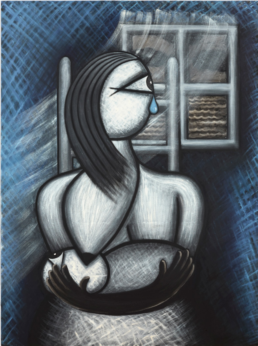
Hein Koh Mother , 2024 Oil on canvas 96 x 72 inches (243.8 x 182.9 cm)