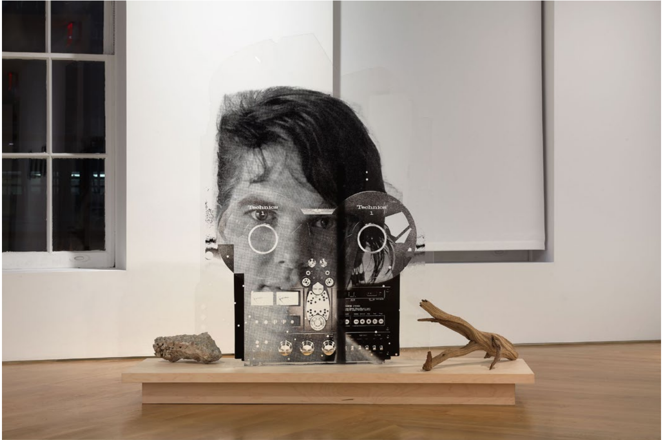
Lothar Hempel Crash , 2017 Print on acrylic glass 59 x 42 inches (149.9 x 106.68 cm) (ak#14369) $36,000