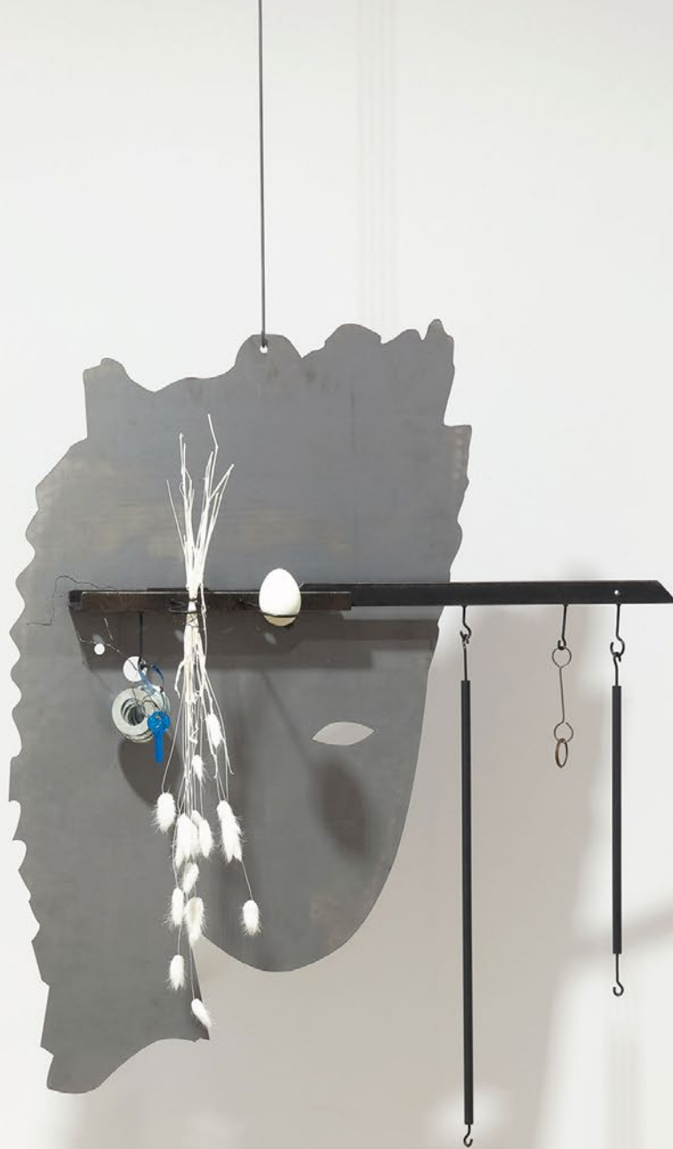
Lothar Hempel Detail, Bell , 2017