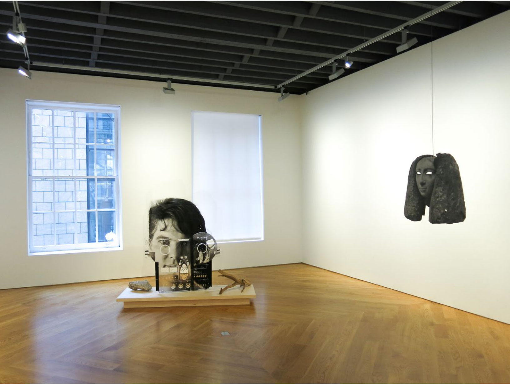
Lothar Hempel Installation view, Oral Heart , 2017