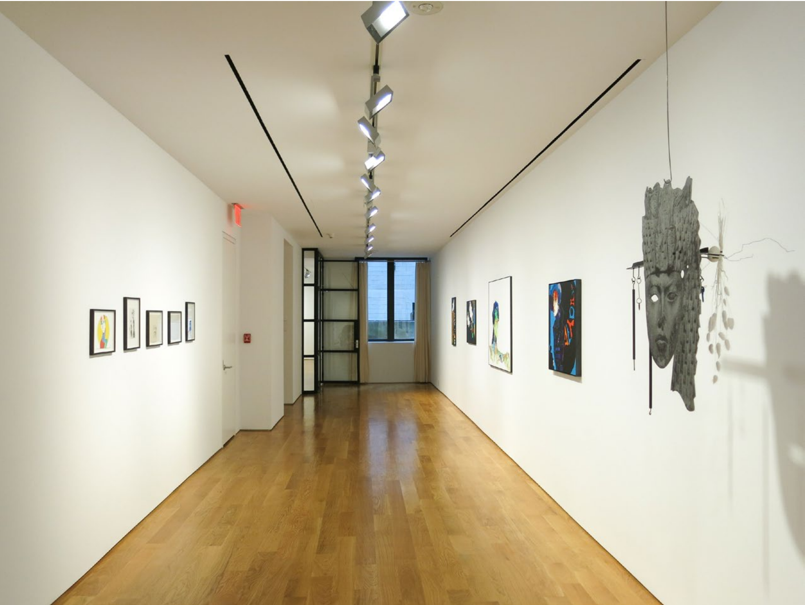
Lothar Hempel Installation view, Oral Heart , 2017