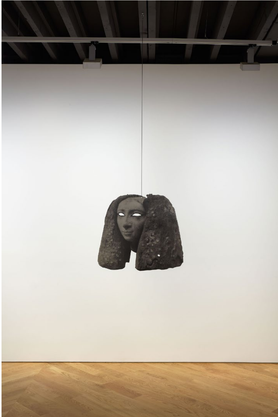
Lothar Hempel Sun Sun Sun , 2017 Steel 31.5 x 31.5 inches (80 x 80 cm) (ak#14370) $16,000